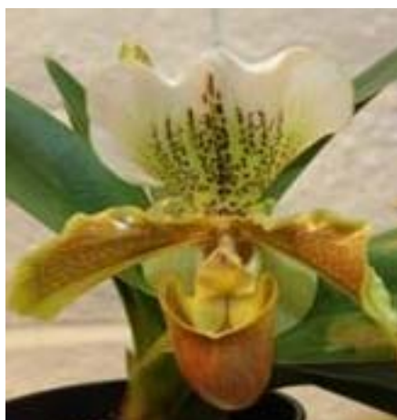
Paph Blendheim Palace 'Royal Pride' x Vallarrow 'Red Rock'