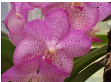
Unknown Vanda Grown by: Sabrina Roque

Web Site: Don Goss.....310-316-3595 Orchids at South Bay Orchid Society dot com