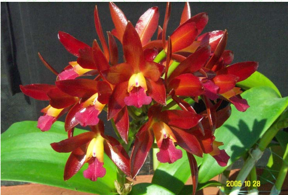
C. Chocolate Drop 'Kodama' AM/AOS; Grown and photographed by Tom Renger

South Bay Orchid Society c/o Sabrina Roque 916 Silver Spur Rd., Ste. 201 Rolling Hills Estates, CA 90274