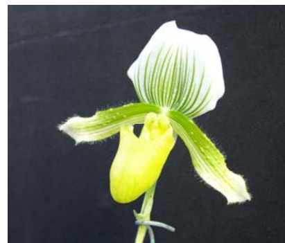
Paph. Claire de Lune 'Edgar Van Belle' AM/AOS Grown by: Tom Renger