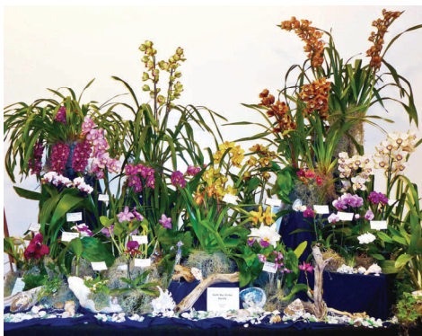
Our display in 2010

Look at our last year's attractive display at Newport Harbor Orchid Show — we will be creating an exhibit this year too for their January 28-30 show.