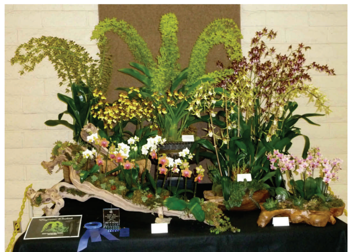
Exquisite Orchids' Blue Ribbon Exhibit