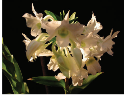
Courtesy of Diar Tambunan© http://forum.theorchidsource.com/ubbthreads.php/topics/126011/Dedrobiumdearii_aneverbloom.html

To further confuse the issue, in 1913 dendrobium sanderae was described. It comes from a different area of the Philippines, the Luzon region, hence the