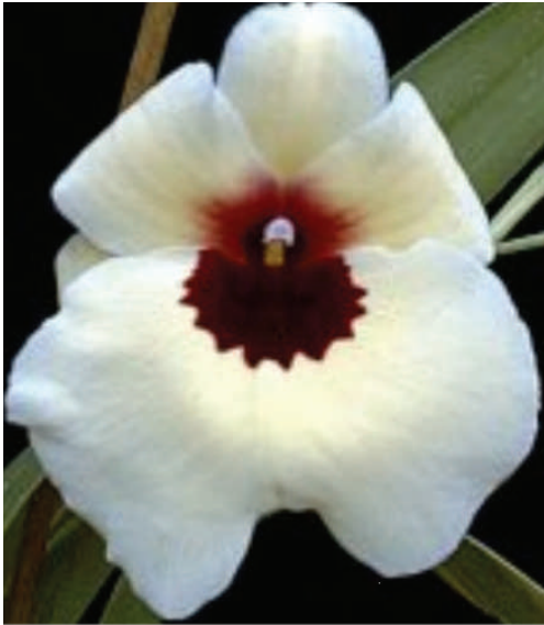
Miltoniopsis Versailles ( vexillaria -Carolina- x Ambre 'London Conference' AM/AOS)