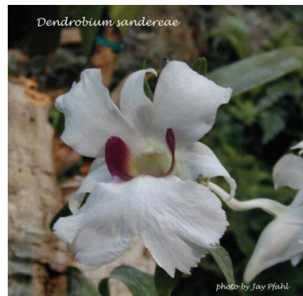
Courtesy of Jay Phal© Plant grown by JEM Orchids http://www.orchidspecies.com/densanderae.htm

Too bad, ovipostiferum is not around. Ahnuld says that without DNA testing all claims of paternity remain highly suspect.