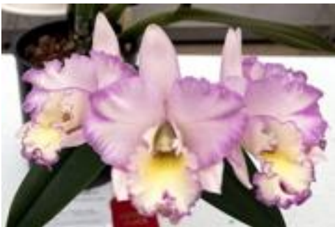
RHYN. Picotee Passion