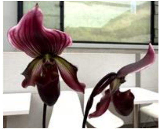
Paph. Supersuk X Raisin Pie