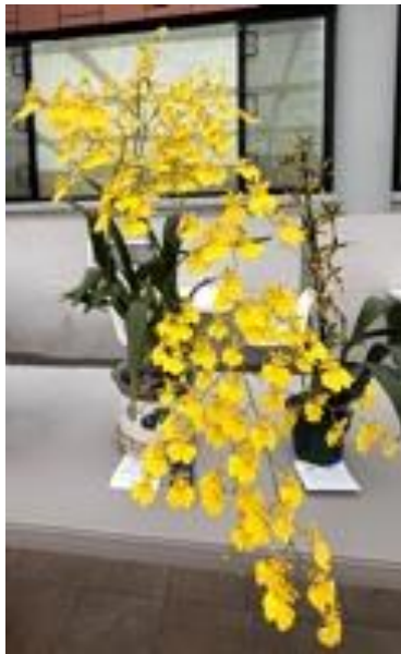
Onc. Gower Ramsey 'Pure Yellow'