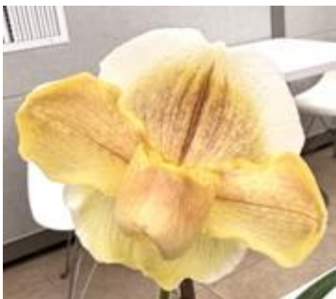
Paph. Big Island Mood X Topaz Charm