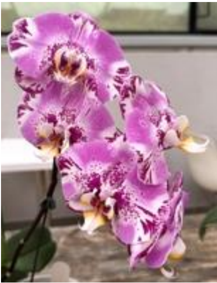
Phalaenopsis NO ID